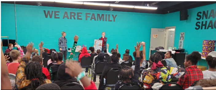
Local youth teach at the Boys and Girls Club in Hopkinsville.

Memory verses, games, snacks, and the true meaning of Christmas was shared with students in afterschool programs at Walton-Verona, Dry Ridge and Crittenden-Mount Zion Elementary Schools as well as South Side and Bellevue Baptist Churches, Ida Spence United Methodist Mission, and Challenge Houses in Hopkinsville, KY.