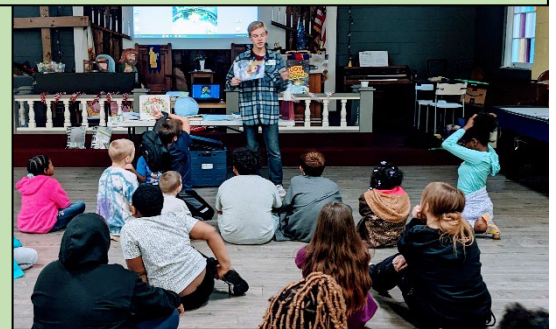
Children listen intently to the Bible Lesson at Ida Spence Mission.

The true meaning of Christmas was shared with 280 children in the Northern Kentucky Chapter and another 100 children in Hopkinsville by our Christian Youth in Action (CYIA) volunteers.