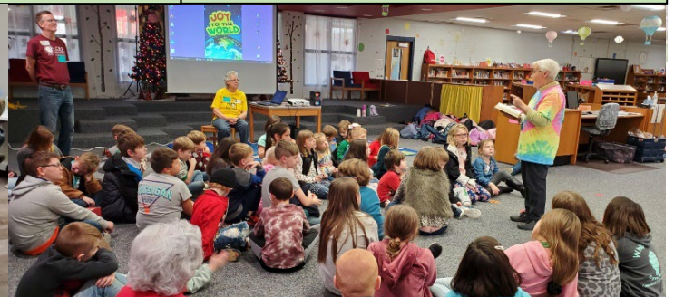
Crittenden-Mt. Zion Elementary School