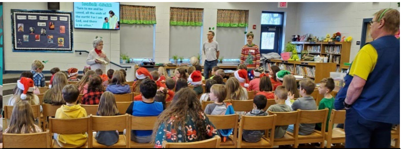
Isaiah 45:22 being taught at Walton-Verona Elementary School