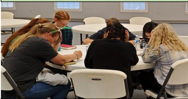
Volunteers praying before going into the mission field to share at Christmas parties

The true meaning of Christmas was shared with 280 children in the Northern Kentucky Chapter and another 100 children in Hopkinsville by our Christian Youth in Action (CYIA) volunteers.