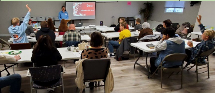
Student volunteers training for Christmas parties!