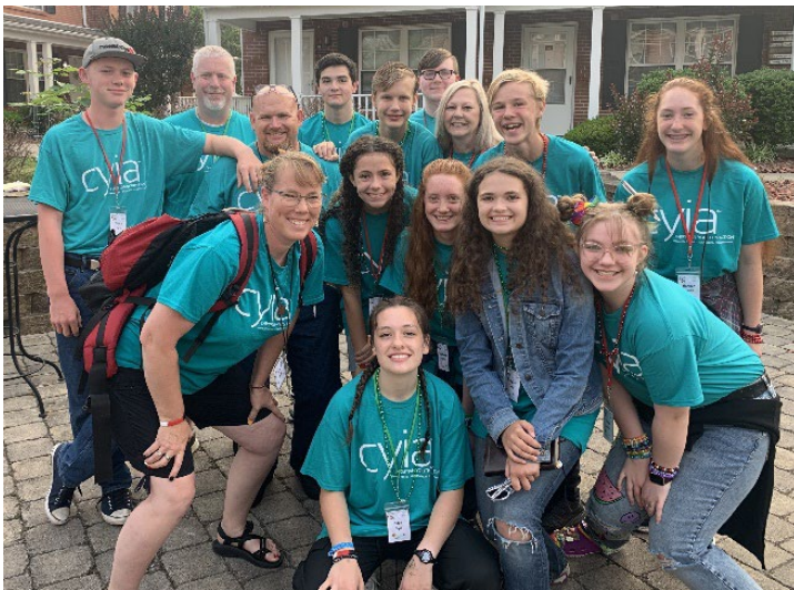
CEF of Northern Kentucky CYIA Students - June 2023 Having Fun While Learning at Campbellsville University

After this training , you will join a team of young people to teach clubs in local areas. Clubs take place in the community with mostly unsaved kids who don't regularly attend church. You will be able to take the light of the Gospel to them in public parks, backyards, local community centers, Boys and Girls Clubs, YMCA, and other locations. You will teach clubs from two to six weeks during the summer with an option of also serving at the county fair depending on schedules.